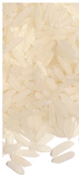
LONG GRAIN RICE